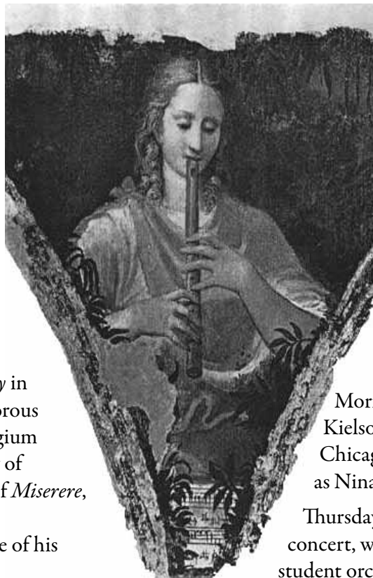
Elderhostel Workshop Orchestra

Josquin des Prez is thought by many to be the greatest composer of the high Renaissance. In testament to his extraordinary compositional style, Martin Luther wrote, "He is the master of the notes. They must do as he wills; as for the other composers, they have to do as the notes will." Among Josquin's greatest achievements was his ability to match the music to the text which created a unique expressivity unknown in musical composition up to that point. Josquin's compositions span an amazing range of styles from the exquisite, austere style of Miserere – Psalm 50 , which is thought to have been inspired by Savonarola's meditation on sin and repentance, to the somewhat ludicrous, secular piece Allégez moy in which "your beauty makes me amorous just below the navel." In the collegium we will explore his amazing variety of compositions by playing sections of Miserere , the 8-part sacred motet Tulerunt Dominum meum , and one of his nearly 70 chansons, Allégez moy .