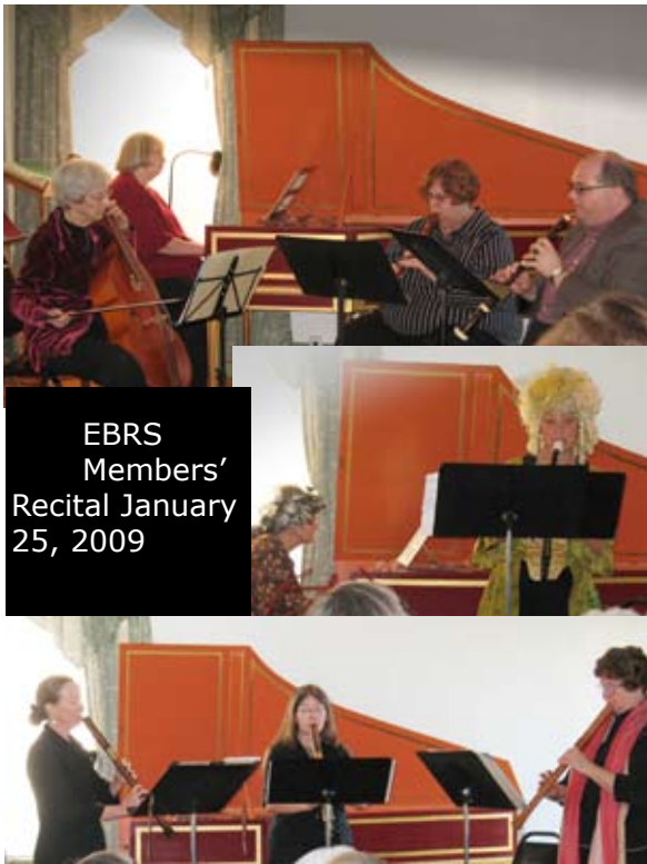
EBRS Members' Recital January 25, 2009